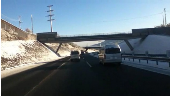
Figure 5: Snowy condition.