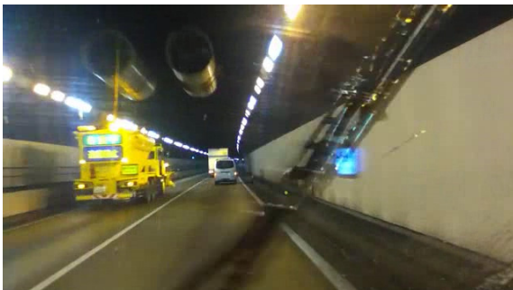
Figure 7: Tunnel.