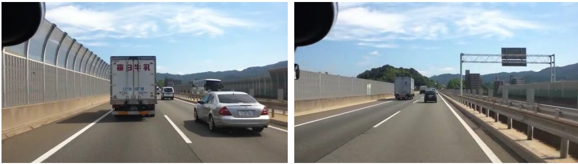
Figure 1: Daylight condition.

14 samples images (two from each category):