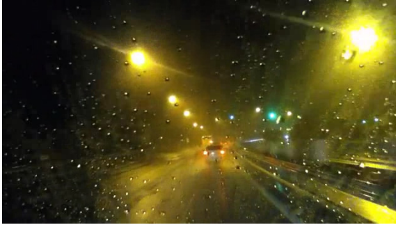
Figure 4: Rainy night condition.