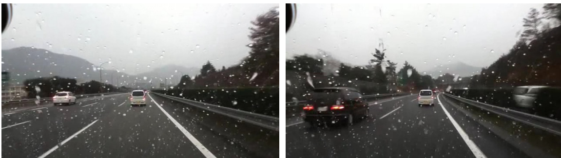
Figure 3: Rainy day condition.